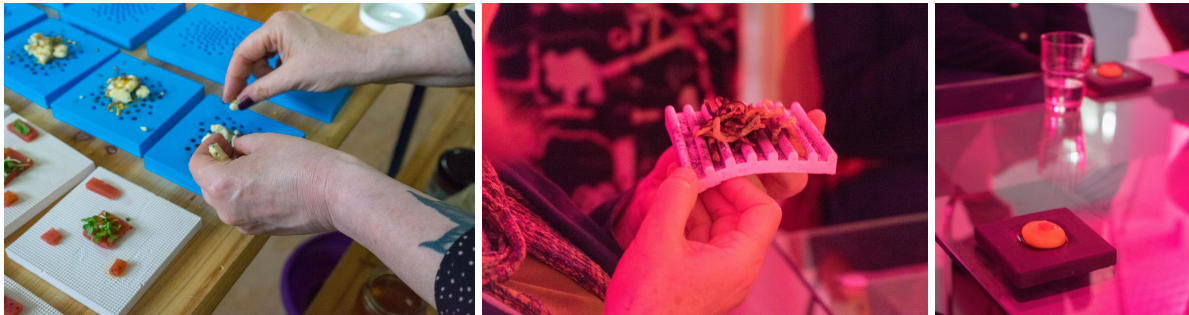
Tasting Shape event images

I collaborated with designer Adam Carthy in an exploration of the impact of materials on flavour and sensuality. We presented ' Tasting Shape ' at Birmingham Design Festival, 2019. This interactive event invited audiences to use their tongues, lips and mouths to lick, suck and caress – exploring the pleasures of taste and texture combined. Using a series of six textured 'plates' we began to explore the symbiotic relation of food and object, and how this affects our sensory perception. Next steps will not only consider surface and taste, but open up wider concerns around ergonomics, gesture and embodiment.