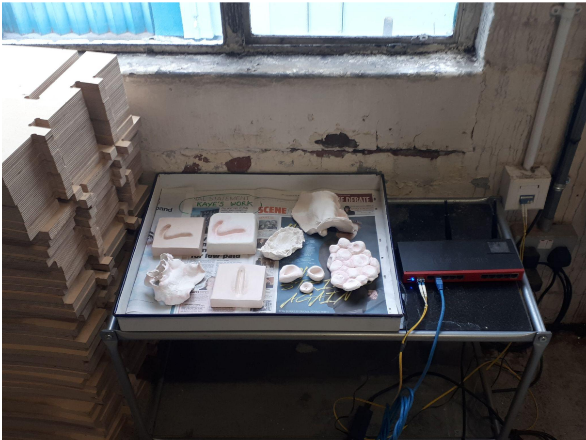
Fire clay tests

I spent some time with artist Suzi Osbourne talking about the properties of clay and the potential of ceramics to create sensual tablewares. We tested out a few ideas which were successful, however progress was interrupted due to my illness/Covid lockdowns but I have the materials to pick up this research with her at a convenient time.