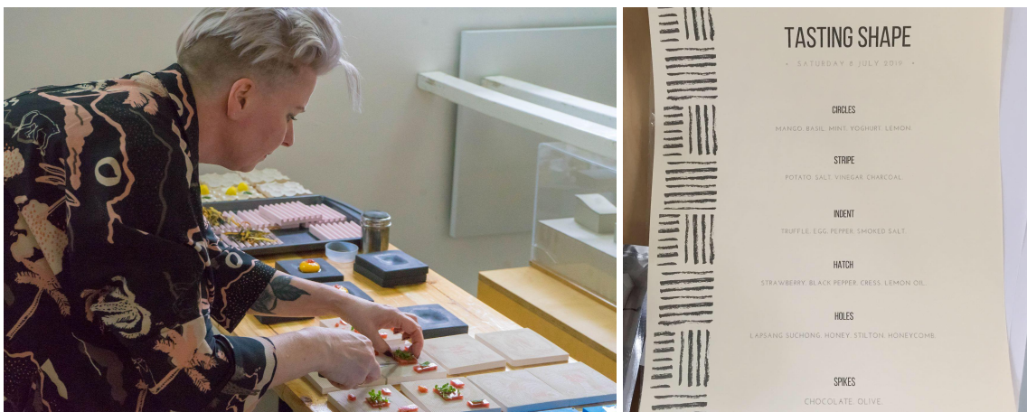
Prep (L) and Tasting Shape Menu (R)