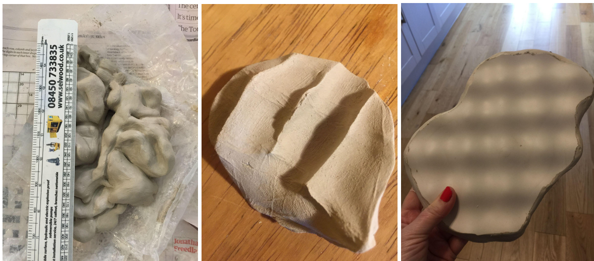
Surface/texture in clay

I spent some time with artist Suzi Osbourne talking about the properties of clay and the potential of ceramics to create sensual tablewares. We tested out a few ideas which were successful, however progress was interrupted due to my illness/Covid lockdowns but I have the materials to pick up this research with her at a convenient time.